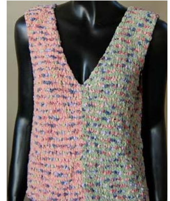
A 2-sided V-neck

1 pair CPY Bamboo or DAISY Needles US size 8 (5mm)