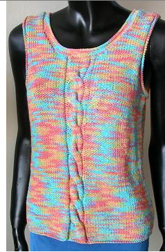
Cabled Shell 6 balls