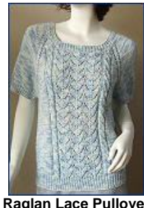
Raglan Lace Pullover 9 balls