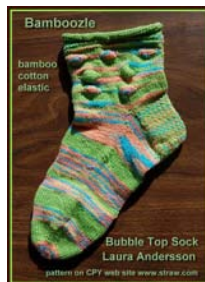
Bubble Cuff Sock 2 balls