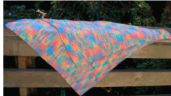
Baby Blanket 6 balls