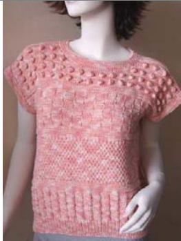
Sampler Pullover 10 balls

55% BAMBOO, 24% COTTON, 21% ELASTIC NYLON 4-5 sts/inch 16-20 sts/10 cm 8-10 US Needles 5-6 mm 90 yds/50 gr 31 colors – 15 prints & 16 coordinated solid colors