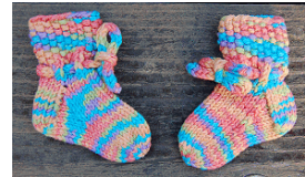
Baby Booties less than 1 ball