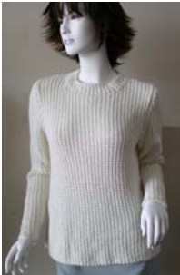
Tunic in Broken Rib 14 balls