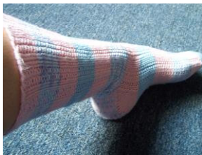
Calf-high sock 2 balls Bamboozle