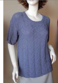
Textured Stitch Tunic 7 balls