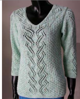
Tunic with Lace Panel 12 balls