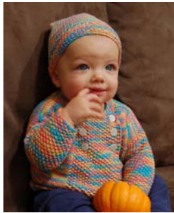
Baby Jacket & Hat 3 balls/1 ball