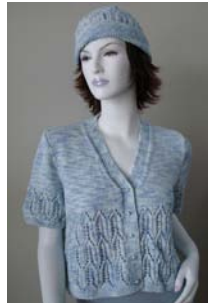
Lace Cardigan + Hat 9 + 2 balls