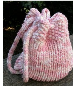
Mini-bag 1 ball